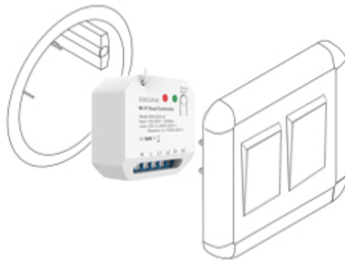
the box of switch