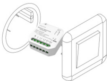
the box of switch