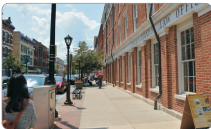
Safe and sound city